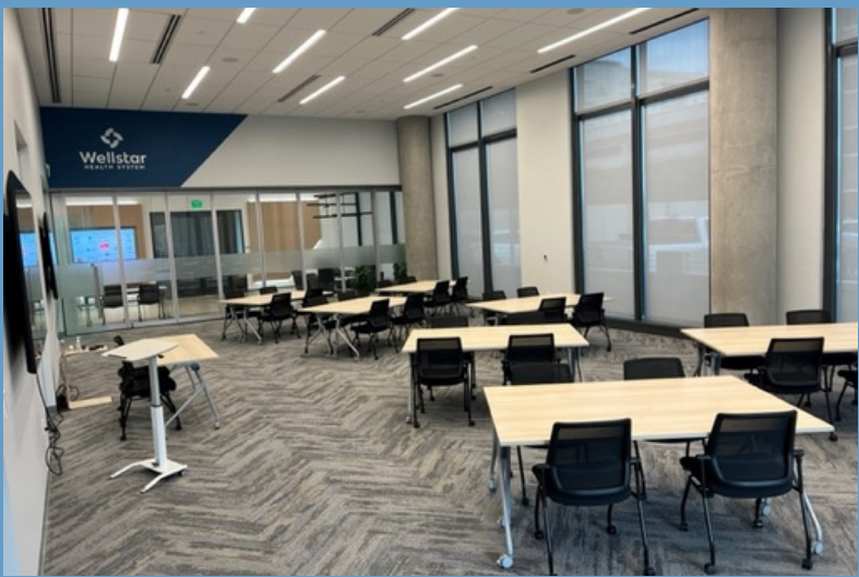
SMALL DISCUSSION PODS