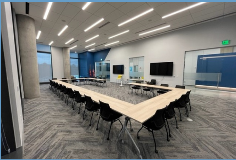
BOARDROOM / OPEN HOLLOW ( 20-40 PPL )