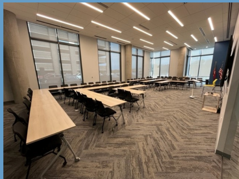
LARGE EXPANDED U-WITH AISLE ( UPTO 100 PPL )