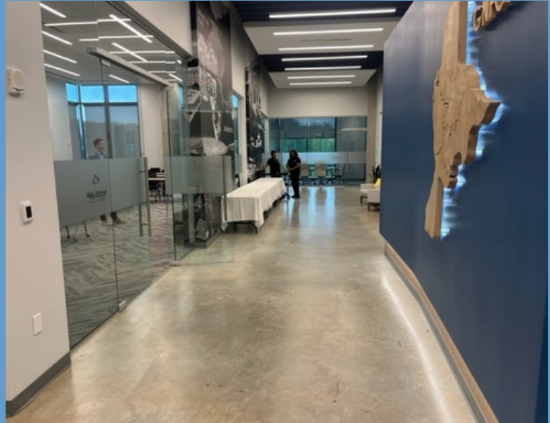
CATERING TABLES OUTSIDE ROOM