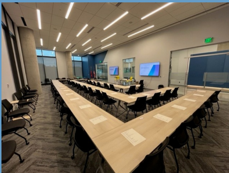
LARGE EXPANDED U-NO AISLE ( UPTO 100 PPL )