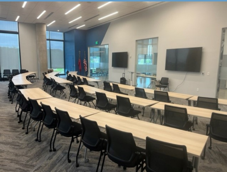
ROUNDED CLASSROOM (30-60 PPL)