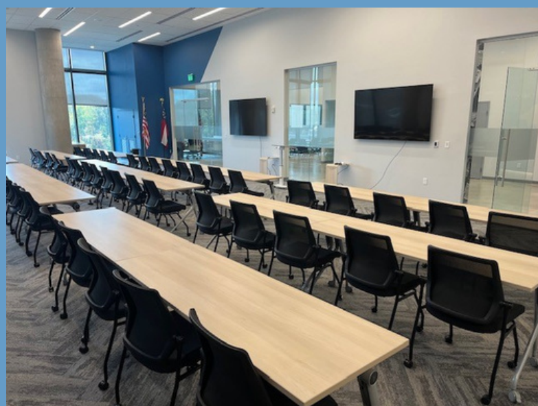
STRAIGHT CLASSROOM (30-60 PPL)