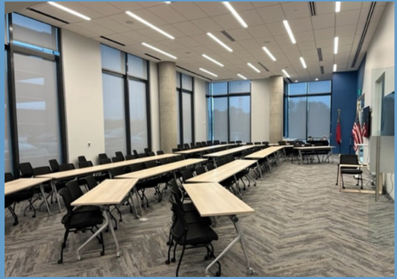
WALL OPENED ( UPTO 100 )