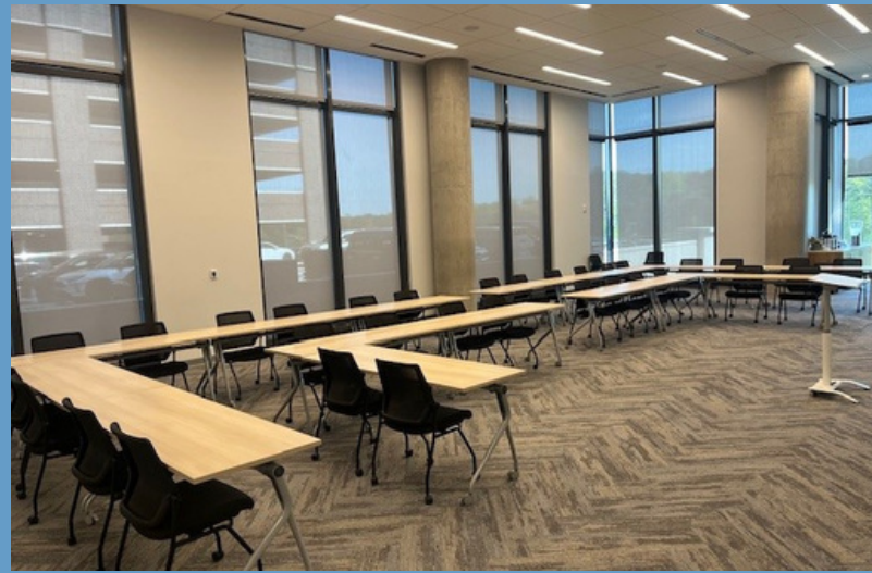
SMALL EXPANDED U-WITH AISLE ( 30-45 PPL )